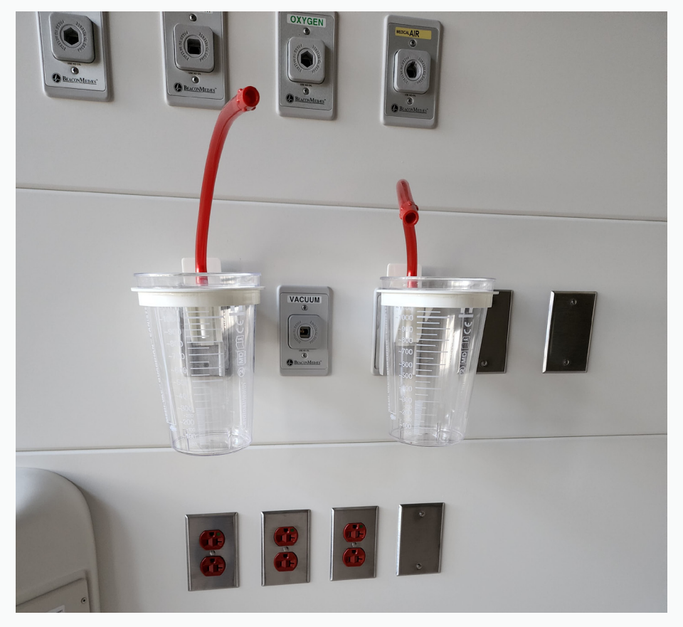
Krista McDonald Biason

Access to receptacles may be blocked or limited where they are located below suction outlets and canisters. Spills onto the receptacles can be a hazard.