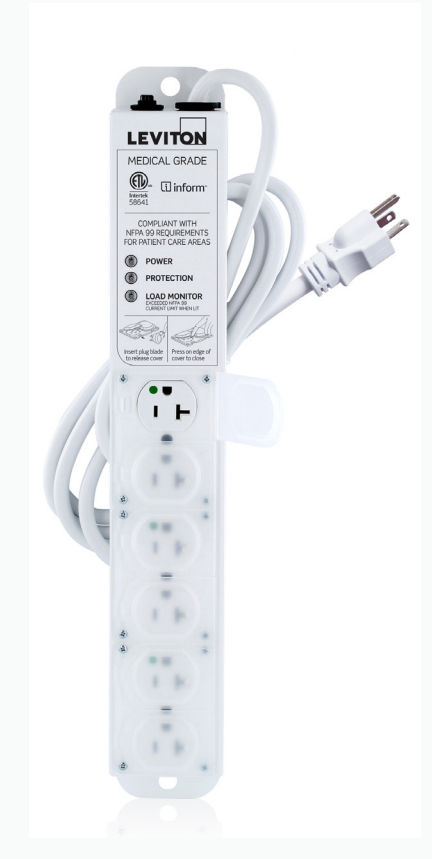
Figure 4: Medical-Grade Power Strip

Medical-grade power strips. Although power strips are commonplace in residential and commercial buildings, codes and standards limit their use in health care facilities. The Centers for Medicare & Medicaid Services (CMS) prohibits their use in patient care vicinities. Even power strips with hospital-grade outlets may be used only outside patient care areas.