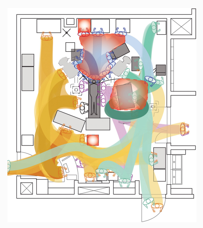
Figure 4: Observed Operating Room Traffic Flow Patterns

flow disruptions as they occurred. Observers watched the traffic flow of personnel in the room through each phase of the procedure: preoperative, intraoperative, and postoperative. The color-coded diagram shows movement of nurses (goldenrod), anesthesiologists (blue), surgeons (purple), and perfusionists (green). The red zones show areas of concern (e.g., the space required for administering anesthesia and the clearance surrounding the sterile field).